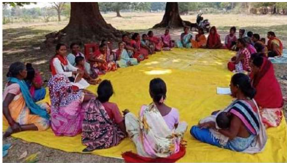
Community Meeting with women for developing family based development and linkage plans