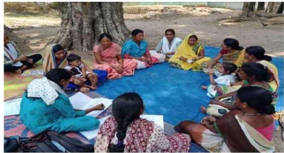
Community Meeting with women and girls for individual development plans for higher education skill training and livelihood.