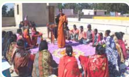
Meeting of MISSI SHGs