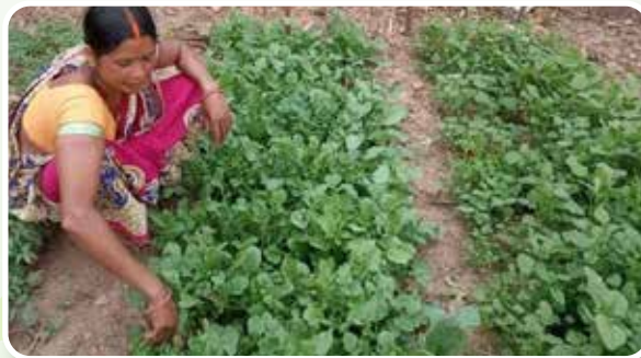
Kitchen garden in Jariya