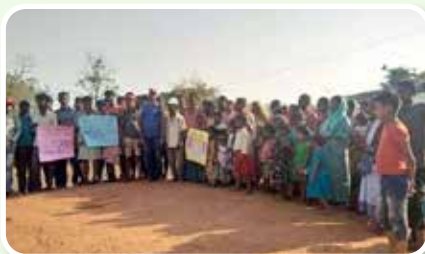
Celebrating Labour Day