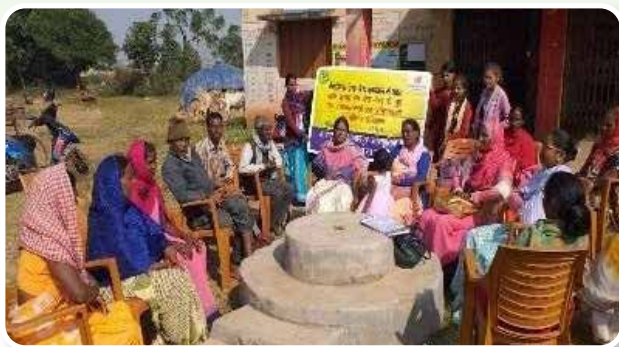
Meeting of parent groups