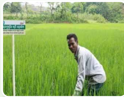
Paddy cultivation through SRI technique