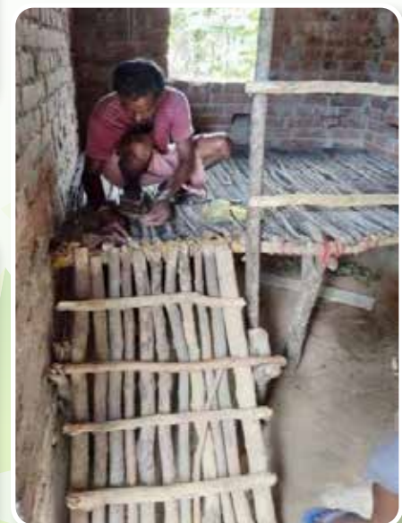
Echo friendly goat shed prepared by PWD