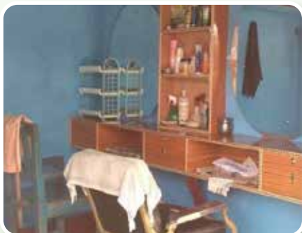
A salon started by Avinash Thakur