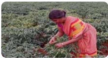
Need based support for livelihood in Malar- Itki