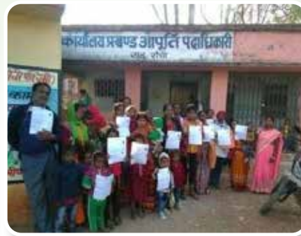
Linkage with PDS in Ratu