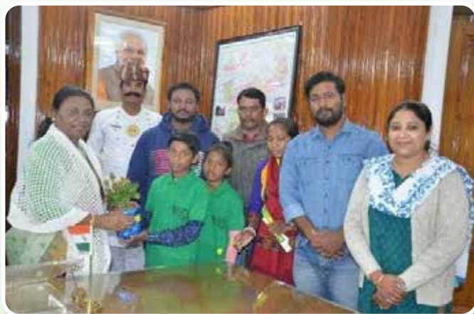
An Open House Campaign under CHILDLINE