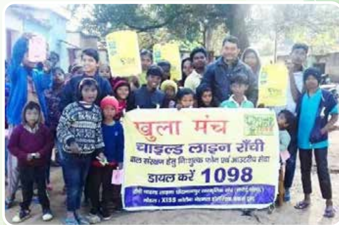
Child Line team along with children visited the Hon. Governor of Jharkhand.