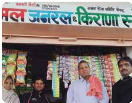
Petty shop in Piplu, Chauparan