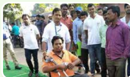
CSS leading the accessible voting