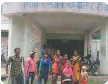
Facilitation of PwDs for Disability Certificate at Civil Surgeon Office, Ranchi