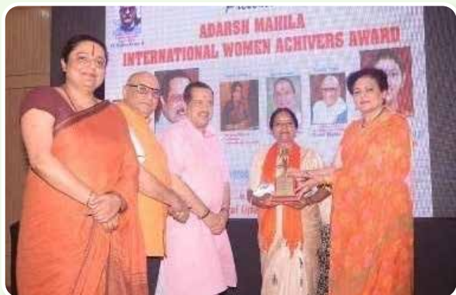
Secretary was awarded International Women Achievers Award "ADARSH MAHILA" by Legal Rights Council-India and Delhi University