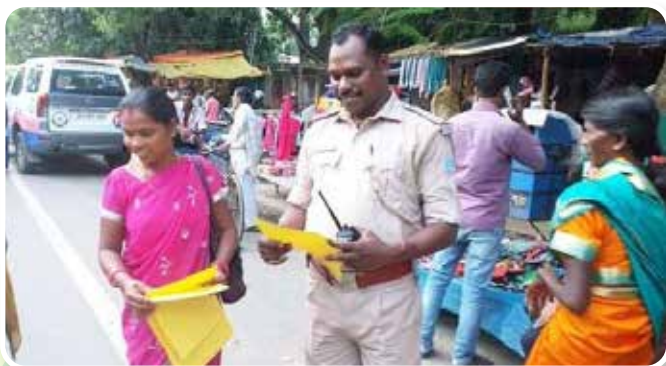
Distribution of IEC materials on child marriage