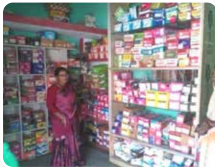
A petty shop started by PWD