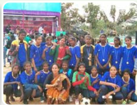
A football team of girls in the state level culmination program of youth festival