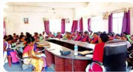
Workshop on child marriage in Bero