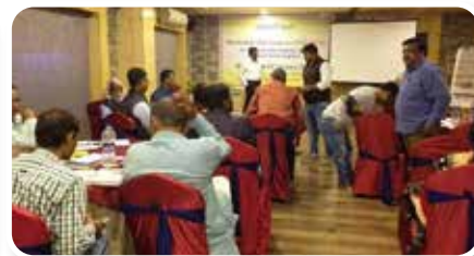
Participation in the "NGO IDEA" workshop at Bhubaneswar