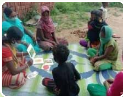
Home based education through TLMs