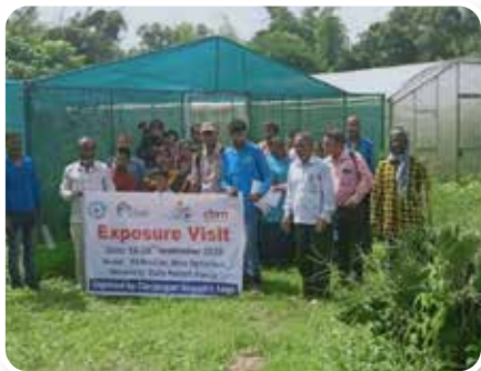
Exposure visit at BAU