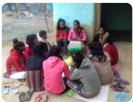
Meeting of girls group