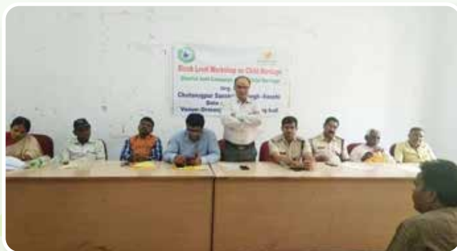
Block level consultation on child marriage in Ormanjhi