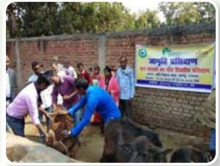
Training on Cow rearing