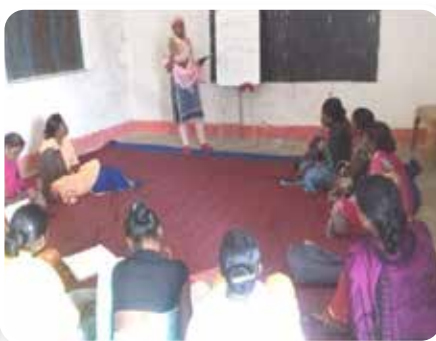
Meeting of Women's group