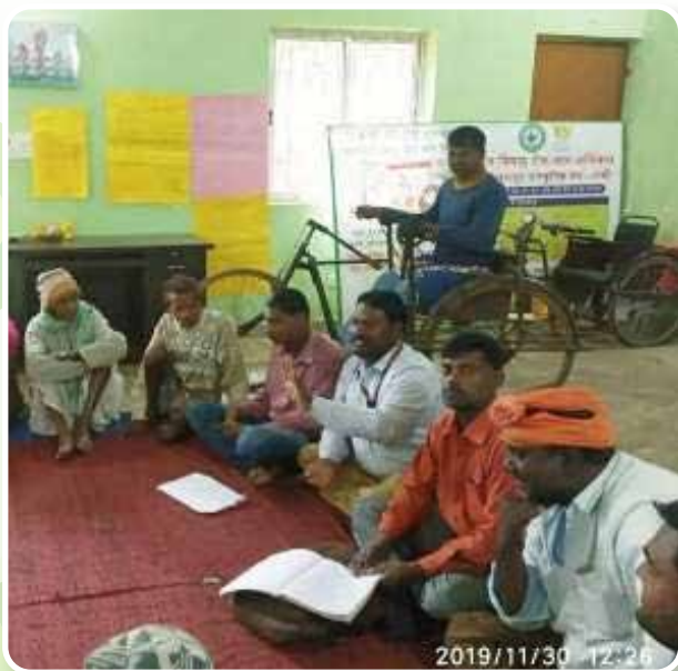
Quarterly planning and review meeting of DPOs