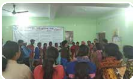
VLCPC Members Training by YCDA Bhubaneswar