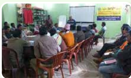
Training of Farmer's club