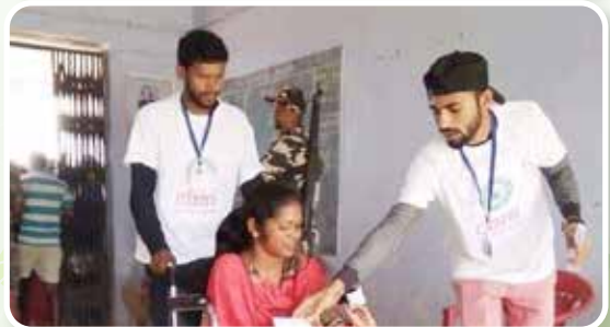
District election officer, JDJM members, DPOs, volunteers, women leaders of MISSI during Systematic Voters' Education and Electoral Participation (SVEEP) programme