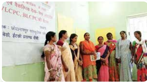
Training programme of VLCPC, BLCPC at Bero