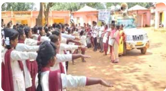
Adolescents taking pledge against child marriage

CSS under the Alternative Child Care programme conducted a rigorous marathon campaign between 30 September – 20 October 2019 in line with the State Plan of Action to end Child Marriage in Jharkhand. In this campaign, VLCPC, SHGs, ICDSW, ASHA, SJPOs, PRI members adolescents, Police personnel, DCPU, BDOs, COs, child clubs, parent groups, community institutions and line departments participated; and awareness drive, block level workshops, district level meeting, oath taking and signature campaigns were conducted. Almost 10,000 people in 7 blocks of Ranchi became aware on acts, schemes and policies related to child marriage. The participants realised the factors behind child marriage and its impact on the overall development of girls. They were informed about the freedom of expression and right to choice which are clearly mentioned in our constitution however still cannot be exercised by lots of girls. This also led to the sensitization of the different govt. officials who are involved in the process and mechanism of stopping child marriage.