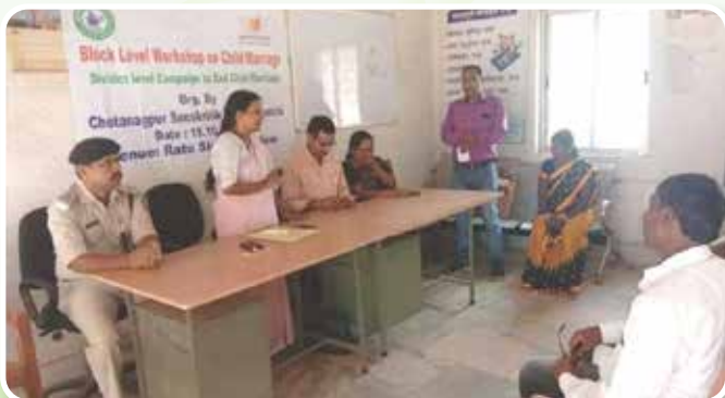
Block level consultation on child marriage in Ratu