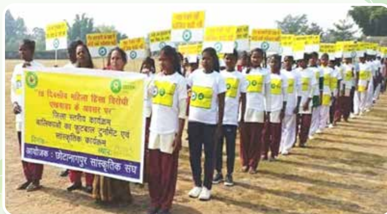
March past by gender champions in the district level programme in Sisai, Gumla