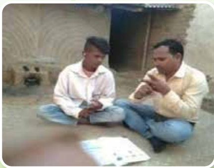
Home Based Education support by special educator