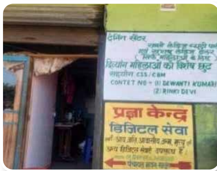
Accessible Pragma Kendra run by a DPO leader in Ratu