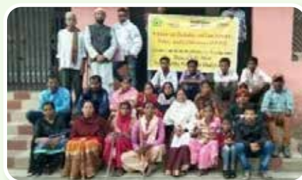
District Level seminar on Disability rights in Jila Parishad Gumla