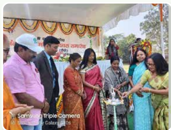
Inauguration at Women's Day celebration