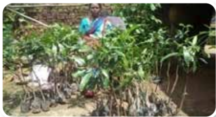
Support of 140 mango saplings for livelihood