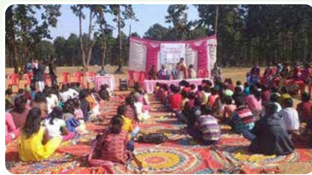
Annual Gathering of child clubs