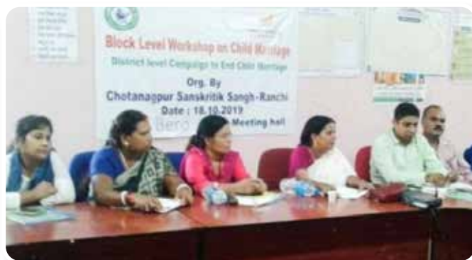
Block Level consultation on child marriage in Bero