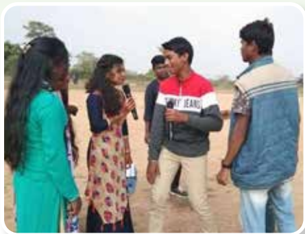
A cultural team of Adolescent performing play level