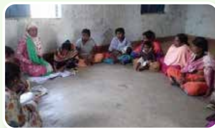
Meeting of 'Jaagruk samiti' in Sisai