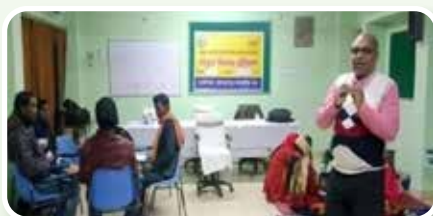
Training of ISHGs on book-keeping and accounts