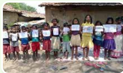
An effort towards child right protection