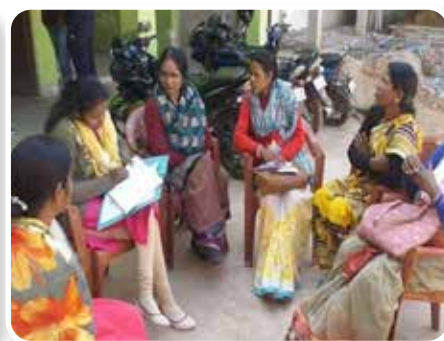
Fact finding team at CSS field office