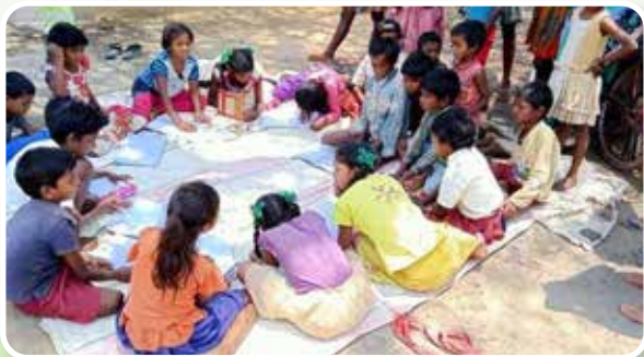
Meeting of child club