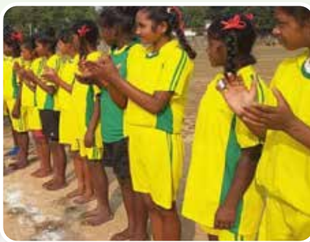
A football team of Girls in district youth festival at Sisai –Gula