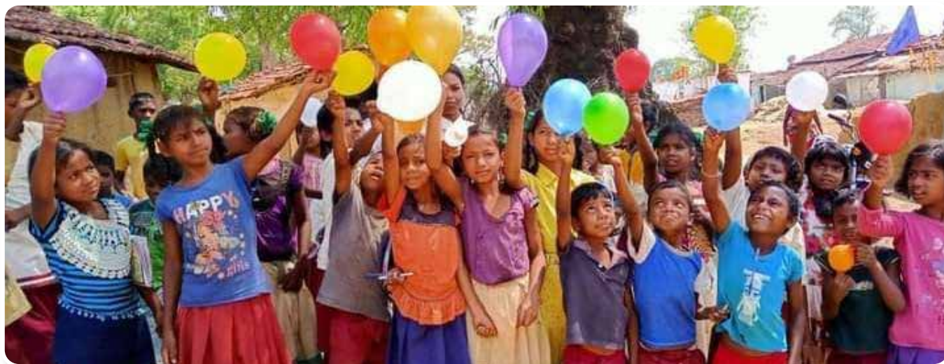
Event with children at ICDS centre at Masu village