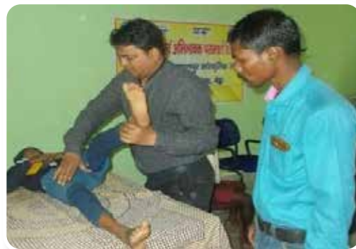
Therapy by physiotherapist