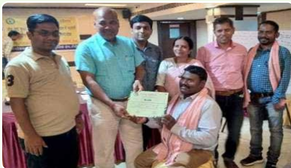
State Disability Commissioner recognized and awarded certificates to 60 PwD volunteers of CSS for their contribution in the accessible voting campaign.