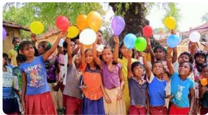
Event with child clubs in Itki