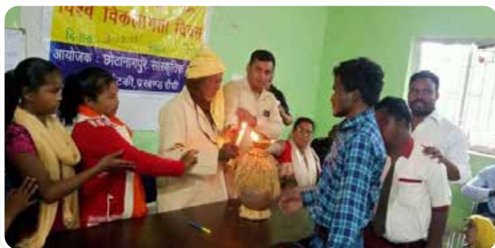
Inauguration of Annual meeting of DPOs