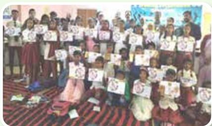
Educating children against child labour