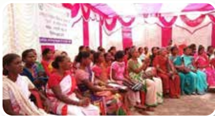
Annual meeting of MISSI federation