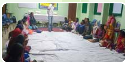
Training of iSHGs and DPOs on leadership development