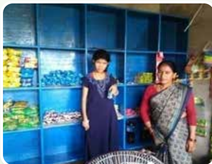
Petty shop run by a mother of CWD