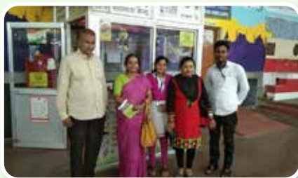
ACC Partners meet at Bhubaneswar, CWC member Ranchi