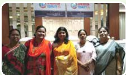
CSS Secretary participating in an Eastern Region Consultation