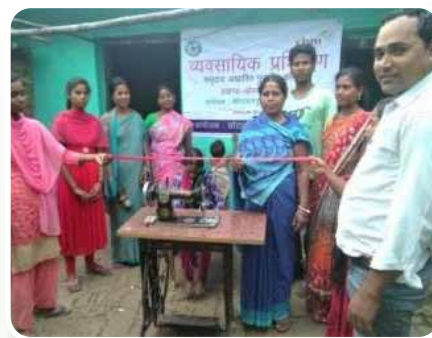
Community tailoring training centre in Ormanjhi