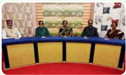
Discussion on Doordarshan on 'Witchcraft hunting'