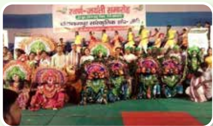
Artist Groups during CSS Golden Jubilee celebration