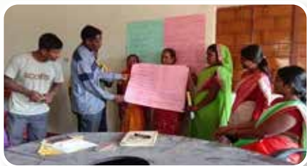
Training of MISSI federation members on accounting

and PRI representatives, strengthening MISSI, awareness and sensitization on gender related issues, strengthening village/panchayat/block level protection committees, preserving rights and entitlements, need- based and emergency support, etc.