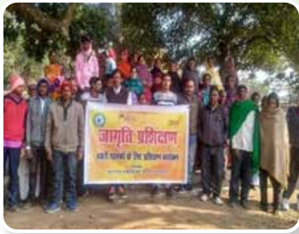
Vocational training at Goat Trust Palkot Gumla Palkot