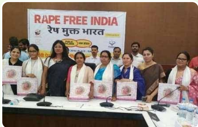
Jharkhand Foundation (supported by Noble, Kailash Satyarthi Foundation) recognized and awarded the