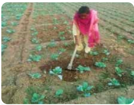
Organic vegetable farming in Ormanjhi