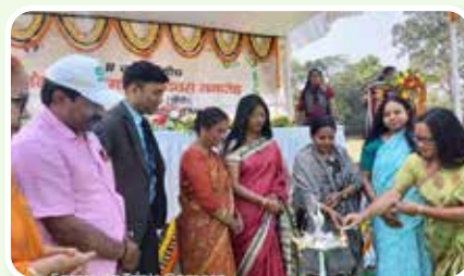
'Bano Nayi Soch' Campaign, Football tournament organized by CSS- Oxfam