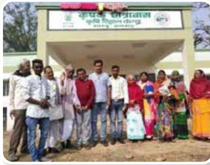
Vocational training at Goat Trust Gumla Gumla Palkot