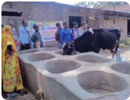
Training on cow rearing at KVK Ramgarh